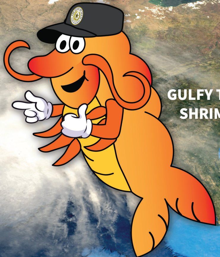
GULFY THE SHRIMP